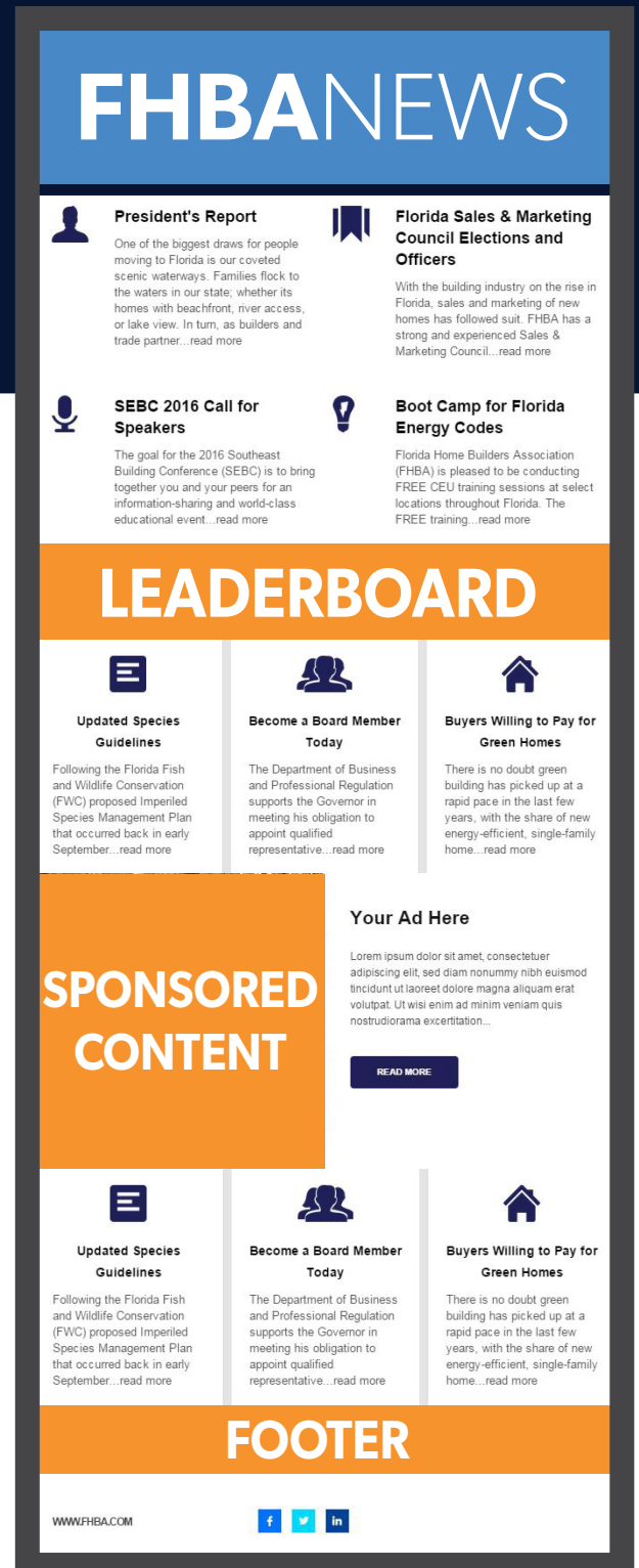
Image displayed for visual example only. FHBA News subject to change.

Available on multi-advertising and/or sponsorship contracts