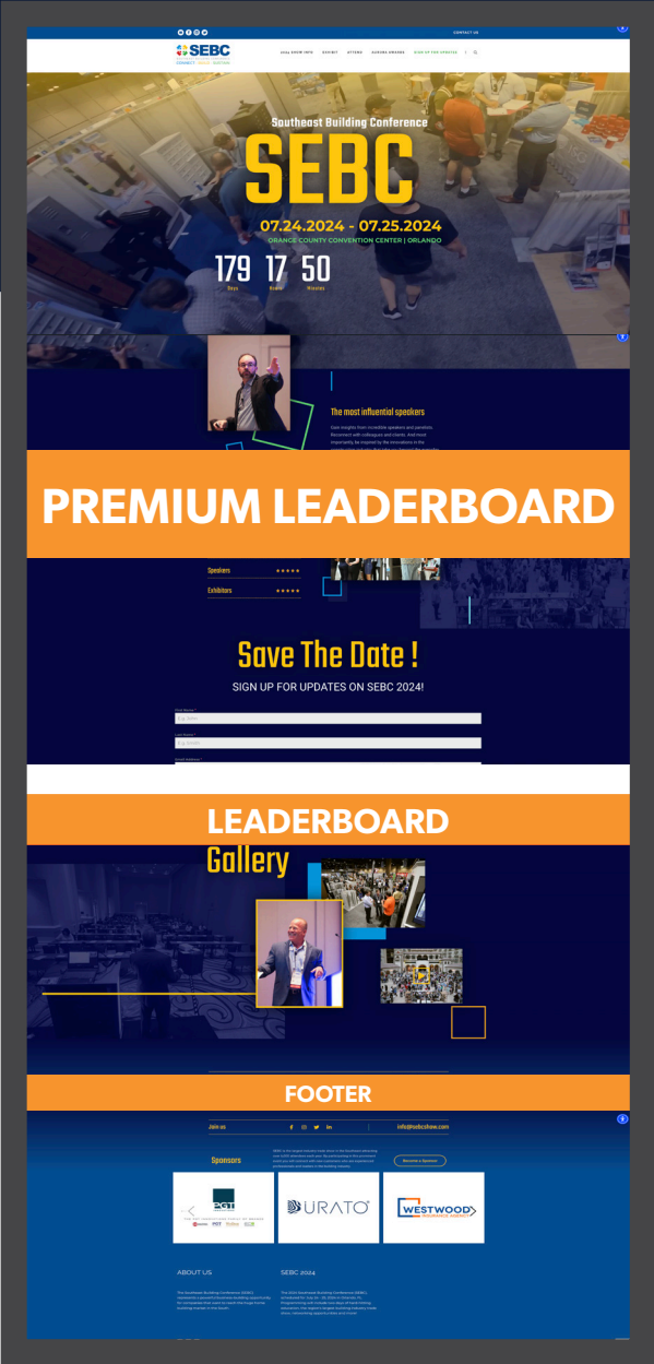
Image displayed for visual example only. SEBCshow.com subject to change.

Frequency: Ads generally sold by the month.